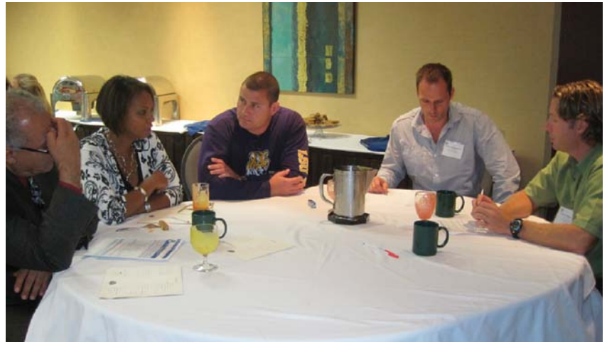
Executive Director during a breakout session.