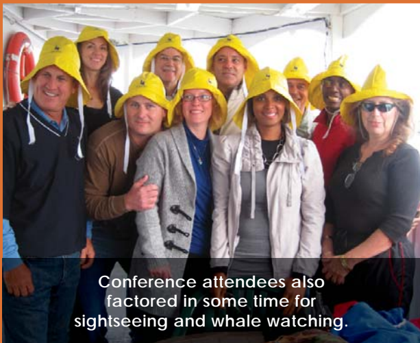
Conference attendees also factored in some time for sightseeing and whale watching.