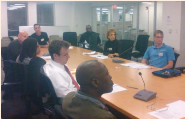
Candidates for Chiropractic Exam, discussing case study.

Applicants for licensure in the District are now required to pass the National Board of Chiropractic Examiners (NBCE) Examination Parts I-IV , and the District of Columbia jurisprudence examination only. In October, 2011, legislation was approved by the DC Council eliminating the local DC examination for ancillary privileges as a requirement for licensure. The regulations implementing the changed District examination requirements became effective October 14, 2011. Beginning with the examination given in November, 2011, the Board of Chiropractic began using the new examination format, 25 multiple choice questions and a case study. Applicants requesting licensure with ancillary privileges in Physiotherapy and/or Acupuncture, must also pass the NBCE ancillary privileges examination. The Board administers the District jurisprudence examination three times per year (March, July and November).